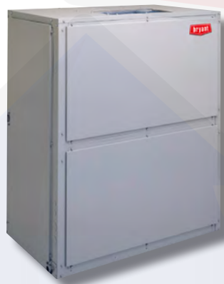
524J Legacy™ 6 to 20 Ton Air Conditioning and Heat Pump Split System Air Handler