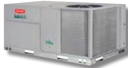
580J/582J Legacy™ Base Efficient 3 to 27.5 Ton Packaged Cooling with Gas Heat