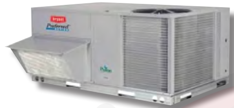
581J Preferred™ High Efficient 3 to 25 Ton Packaged Cooling with Gas Heat