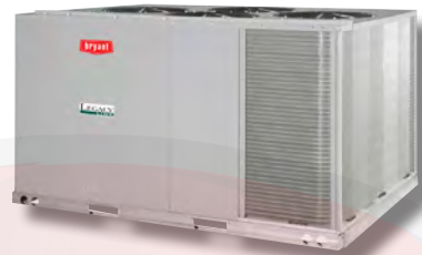
575J Legacy™ 6 to 20 Ton Single and Dual Circuit Split System Condensing Unit