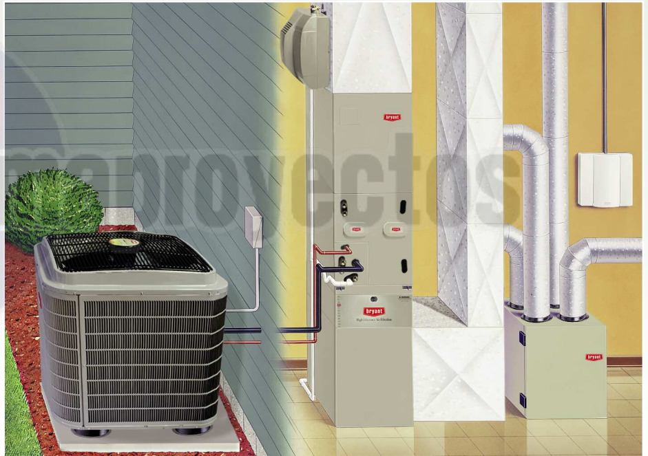
Heat Pump and Fan Coil System

DuraTech™ coil protection reduces the threat of formicary corrosion caused by typical household corrosives.