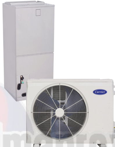
MODEL 38MURA HEAT PUMP with 40MUAA AIR HANDLER

Carrier was the first to offer systems with Puron® refrigerant, which does not contribute to ozone depletion. By replacing an older, less efficient horizontal heat pump with a Performance Series system, you could reduce your energy use and environmental impact.