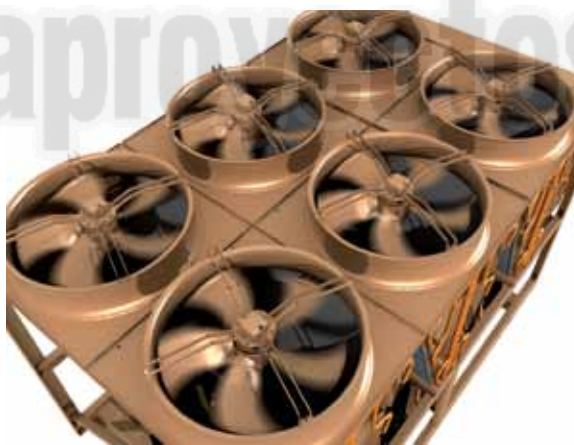
Ultra quiet operation can be obtained through optional ultra-quiet fans and compressor sound blankets.