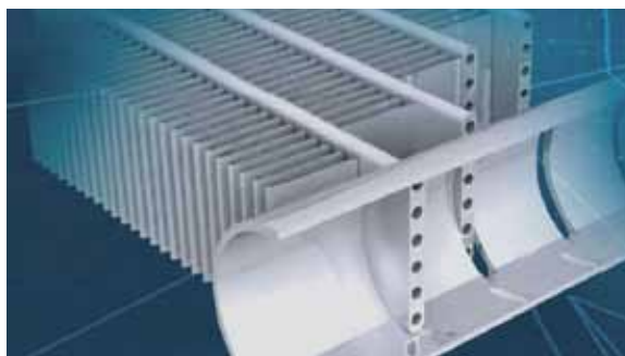
All-aluminum microchannel condenser technology is one reason for the premium efficiencies the YLAA chiller delivers.

The YLAA chiller also reduces noise pollution. To address property line restrictions, YLAA sound attenuation options provide quiet operation to meet your needs. A variety of options – including variable-speed fans and acoustic enclosures – make it easy to operate quietly at off-design conditions to please neighbors during nights and weekends.